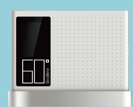
DG60 Max(Enhanced edition)